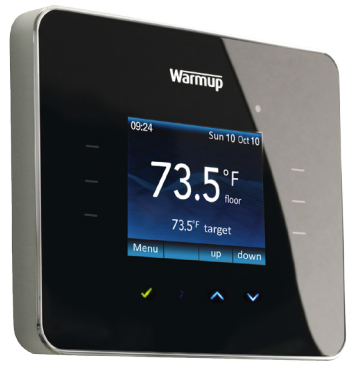
To work with 3iE series controllers from WARMUP!